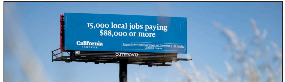
A California Forever billboard stands along I-80 in Vacaville on April 2, 2024.